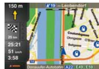
In 2-D mode the map orientation can be set to north or else, aligned with the direction of driving.