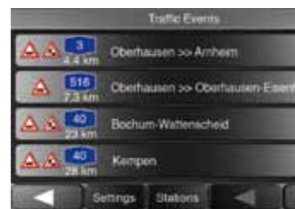
Announcement of all traffic events on the route with TMC