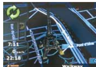
Different colour modes available, e.g. blend poor colours in the night mode