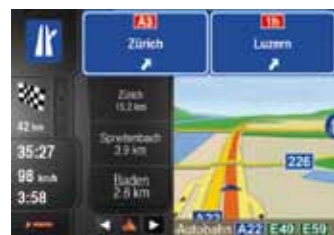
Real signpost rendering: display of highway signs in real-time