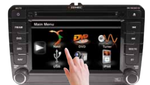
Comfortably access all the functions using the touchscreen.

Contained in the set: An external GPS receiver and external TMC/TMC Pro receiver, which make current traffic reports available. With TMC you will be informed about traffic jams or other obstructions on your route in a timely manner. The navigation system automatically gives you alternative route suggestions so you can avoid annoying traffic jams and unnecessary delays during your journey.