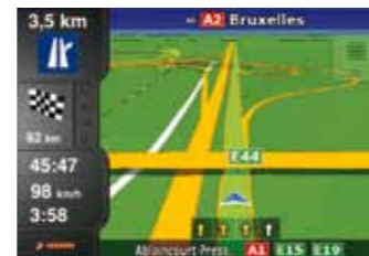
Automatic smart zoom function to enlarge intersections and turning lanes