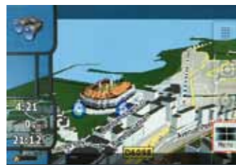
3-D landscape or 3-D city map views with buildings, places of interest and maps