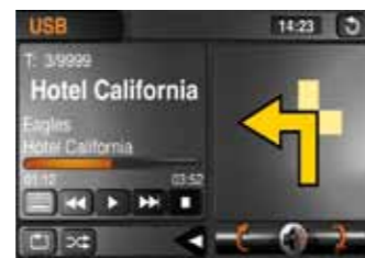
Split screen mode: navigation display within the selected A/V menu